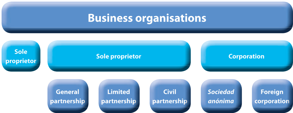
Figure 1. Business organisations in Panama.

There are several types of business organisations in Panama (see Figure 1).